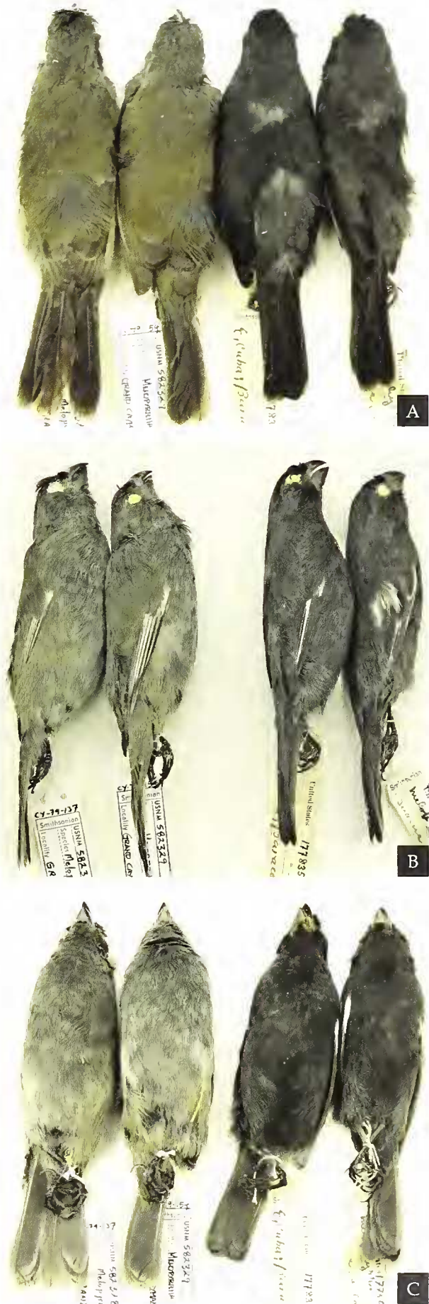
Figure 3. Comparison of plumage coloration between female Cuban Bullfinch Melopyrrha nigra taylori of Grand Cayman (left two individuals) and Melopyrrha n. nigra of Cuba (right two individuals): (A) upperparts, (B) lateral view, (C) underparts, United States National Museum, Smithsonian Institution, Washington DC (James W. Wiley)

Although formerly considered common on Grand Cayman, the bullfinch's range has been reduced and it is now rare to absent west of Savannah due to urban development and loss of habitat due to forest clearance and hurricanes. East of Savannah, it is a locally common resident breeding mainly in dry forest within the protected Botanic Park and Mastic reserve, and in shrubland and woodland in the north and east where continued development threatens habitats (Bradley 2000, Bradley & Rey-Millet 2013). It bred infrequently in mangroves but since Hurricane Ivan (2004) breeding has not been observed in mature black ( Avicennia germinans ), white